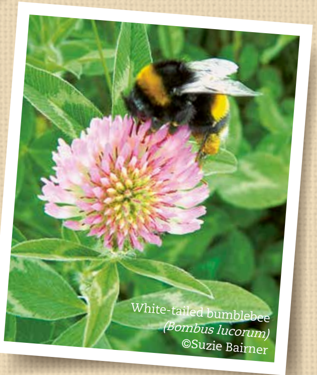
White-tailed bumblebee ( Bombus lucorum )

If you don't have a space for a flower bed, growing the right plants in hanging baskets and planters is a great option. And if you can, try to have flowers in bloom throughout the spring, summer and autumn.