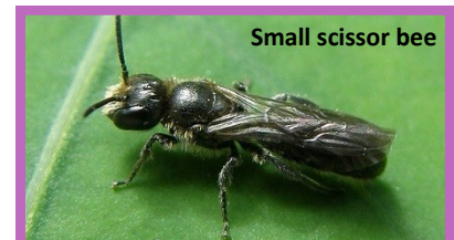
Small scissor bee

Small, slender, black bees with almost cylindrical bodies and large heads. The Small scissor bee ( C.campanularum ) is one of Britain's smallest bees (4-4.5mm) The large scissor bee ( C.florisomme ) grows to 8mm and has distinctive forward-pointing jaws. Females build their nest cells and plug the entrance with mud and sand grains.