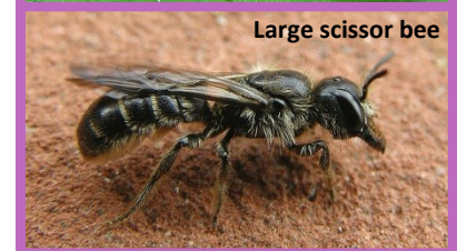
Large scissor bee